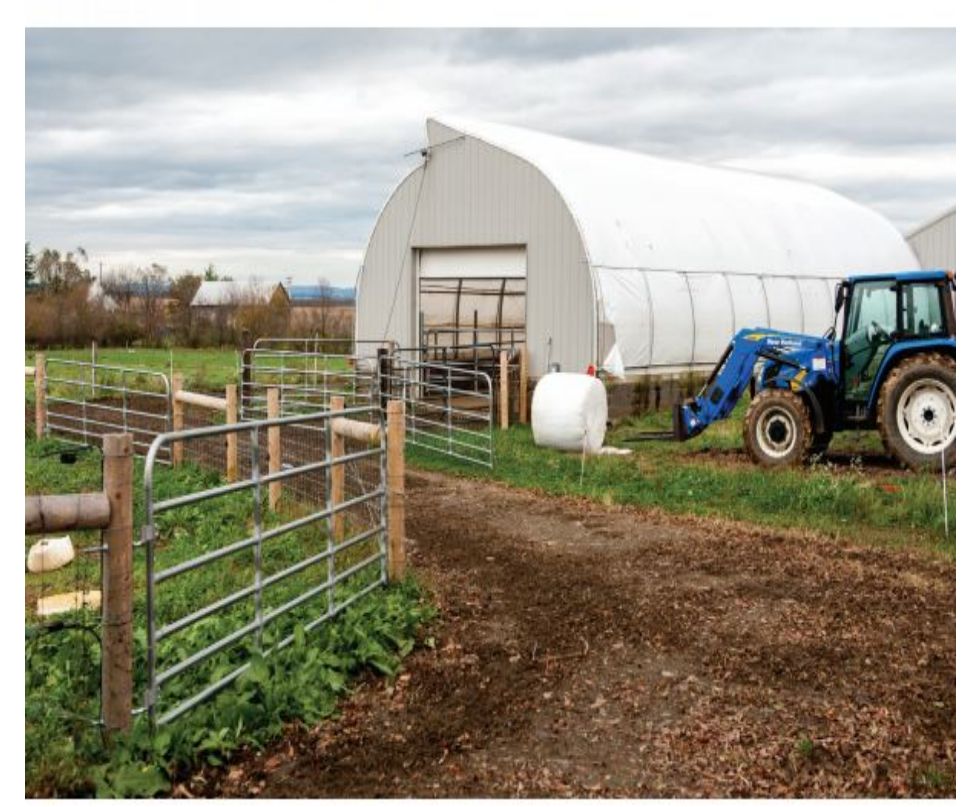
Agricultural Conservation Leasing Guide