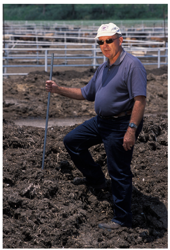
To qualify for an RTF defense, the operation must have been in business for 365 days and provide business records or similar proof that the business complies with all applicable federal, state, and local requirements.

To qualify for an RTF defense, the operator also must provide business records or similar proof that the business complies with all applicable federal, state, and local requirements. Operators will need good business records to ensure they can prove compliance with the relevant laws and regulations. For more information on the importance of good business records to show compliance with applicable laws, see Understanding Agricultural Liability: Legal Risk Management Considerations (UME FS-995, 2015).