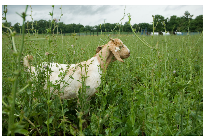
Maryland introduced a Right-to-Farm (RTF) law in 1981 and extended these protections to commercial seafood operations and watermen in 2014. While the law is limited in scope, it can provide powerful protections against nuisance suits in certain situations.

Maryland's RTF law, while limited in scope, can provide powerful protections in certain situations. When faced with a nuisance suit, an agricultural, commercial fishing, or seafood operation in business for at least 1 year and complying with all applicable federal, state, and local laws, ordinances, and permits will have a strong defense.