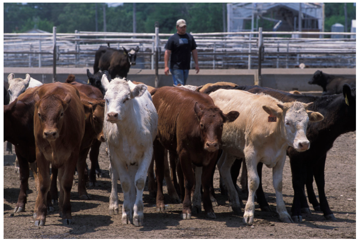
RTF laws do not provide a defense against claims of trespass.